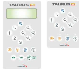
LCD Display (Option)

Easy control of functions thanks to the direct buttons and intuitive color scheme