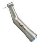
Ti-Max Ti 25L