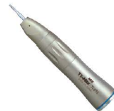
Ti-Max Ti 65L